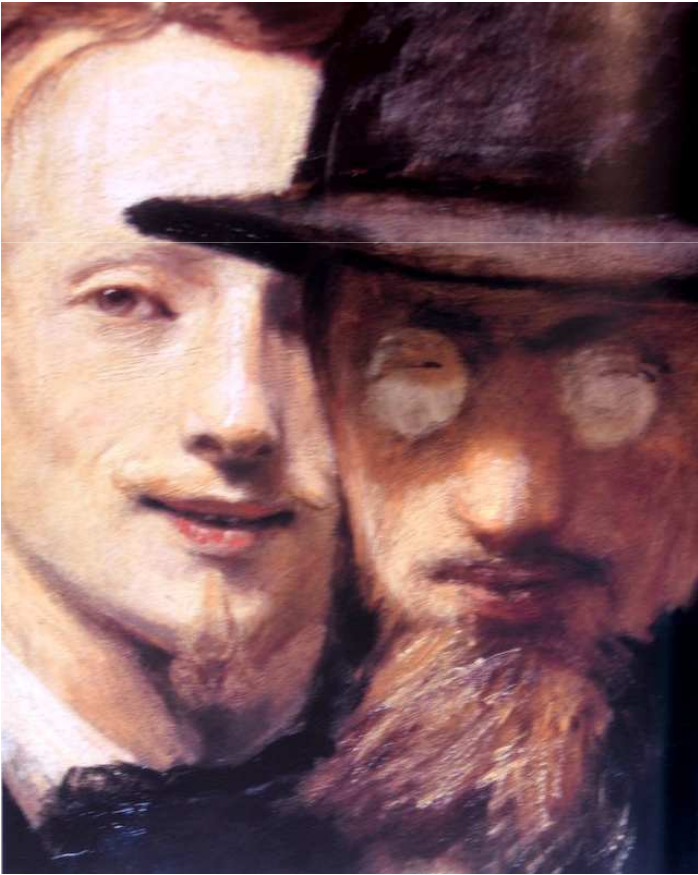
Hans von Marees with Lenbach 1863