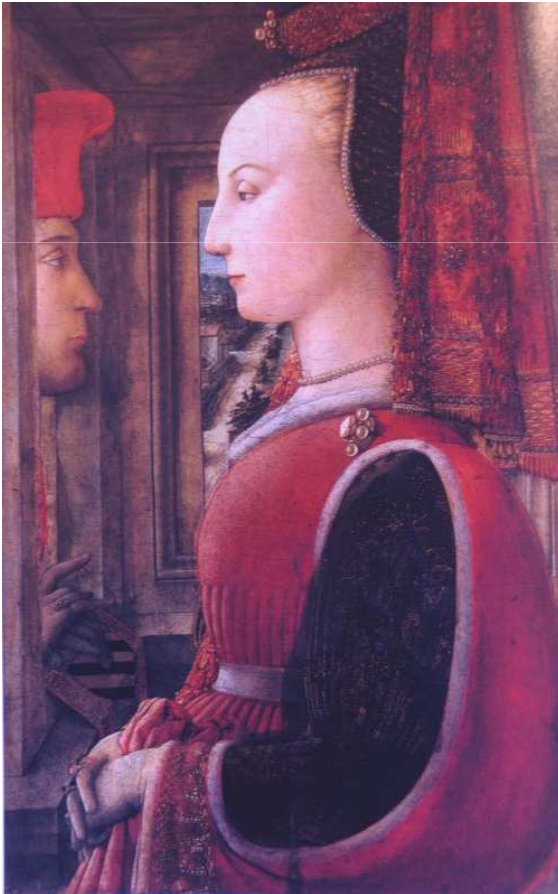
Fra Filippo Lippi Portrait of a Man and a Woman at Casement circ 1435-40 Double Portrait Images